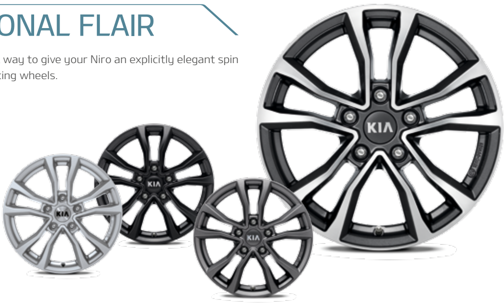
7. Alloy wheel 16" Anyang 16" five-double-spoke alloy wheel, 6.5Jx16, suitable for 205/60 R16 tyres. The perfect addition of an elegant wheel designed for Niro. Cap is included, original nuts can be used. J7400ADE06N (silver) J7400ADE06NBL (black) J7400ADE06NGR (graphite) J7400ADE06NBC (bicolour)