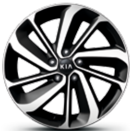
1. Alloy wheel kit 18" 18" five double-spoke machine-finished alloy wheel, 7.5Jx18, suitable for 225/45 R18 tyres. Kit includes a cap and five nuts. G5F40AK100 (HEV MY 17)