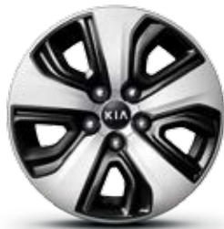
5. Alloy wheel kit 16" 16" five-spoke alloy wheel with full wheel cover, 6.5Jx16, suitable for 205/60 R16 tyres. Kit includes a cap and five nuts. G5F40AK000