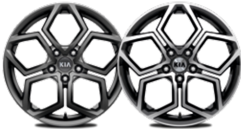
2-3. Alloy wheel 18" Hanyang 18" five-double-spoke alloy wheel, 7.5Jx18, suitable for 225/45 R18 tyres. Cap is included, original nuts can be used. G5400ADE08NGR (graphite/ HEV MY 17 & MY 20) G5400ADE08NBC (bicolour/ not recommended for winter season/ HEV MY 17 & MY 20)