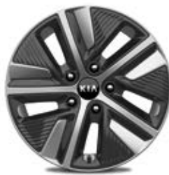
6. Alloy wheel kit 16", type-B 16" 5-spoke alloy wheel with full wheel cover, 6.5Jx16, suitable for 205/60 R16 tyres. Kit includes a cap and five nuts. G5F40AK020 (HEV & PHEV MY 20)