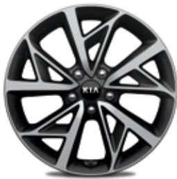
4. Alloy wheel kit 18", type-B 18" five-double-spoke alloy wheel, 7.5Jx18, suitable for 225/45 R18 tyres. Kit includes a cap and five nuts. G5F40AK030 (HEV MY 20)